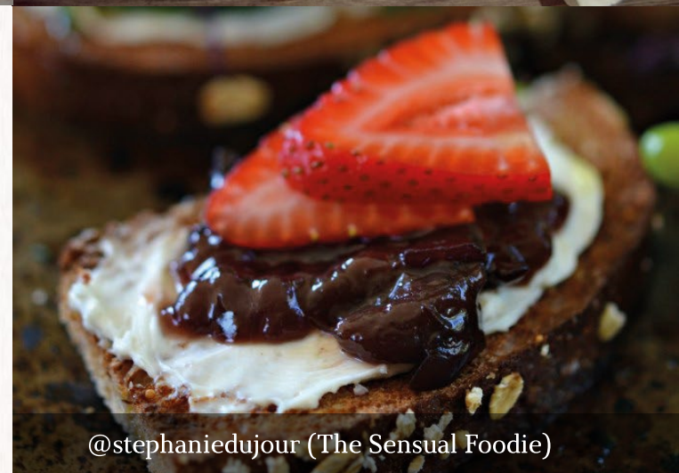
@stephaniedujour (The Sensual Foodie)

Just for Cheese pairings are the perfect gift for any gourmand.