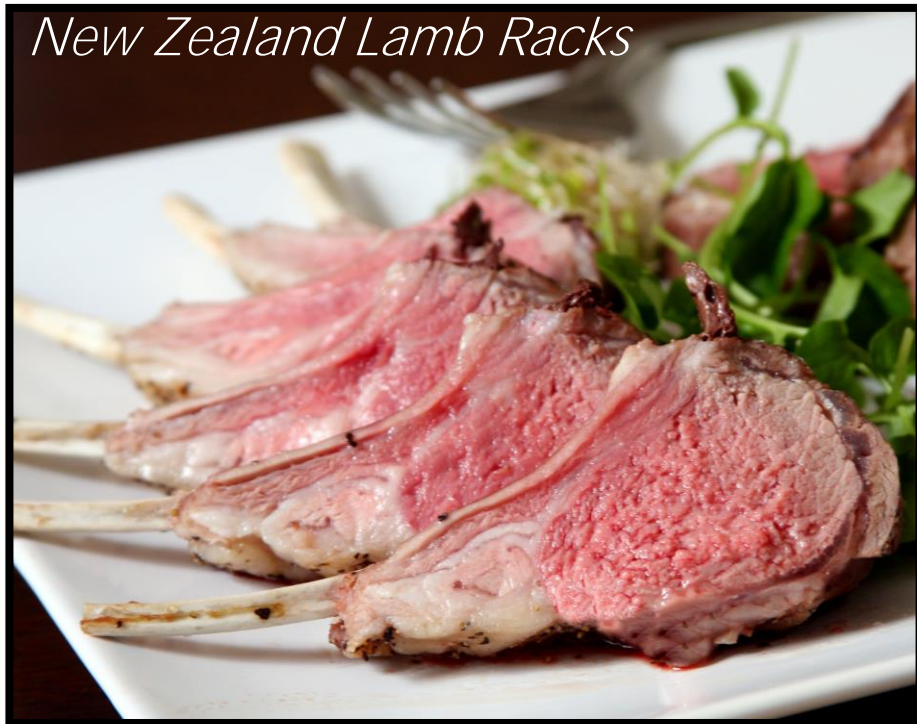
New Zealand Lamb Racks