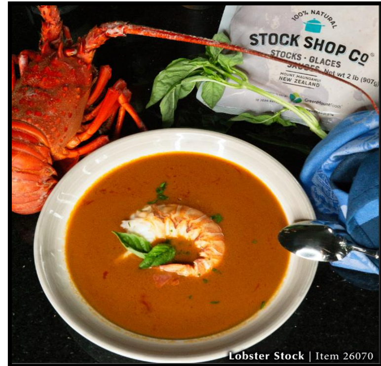
Lobster Stock | Item 26070