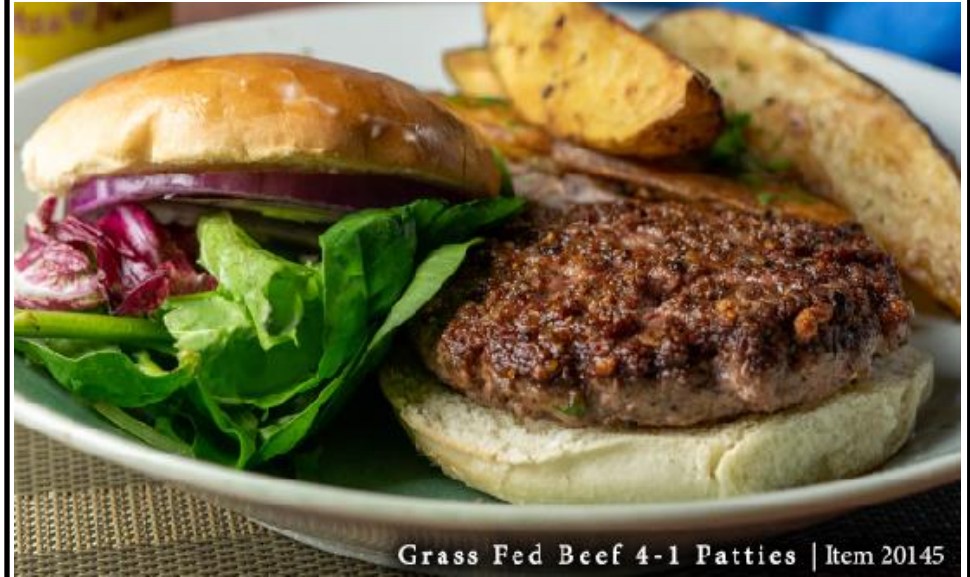
Grass Fed Beef 4-1 Patties | Item 20145