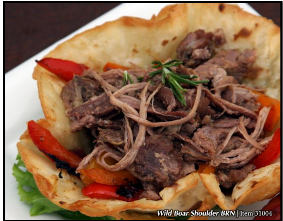
Wild Boar Shoulder BRN | Item 31004