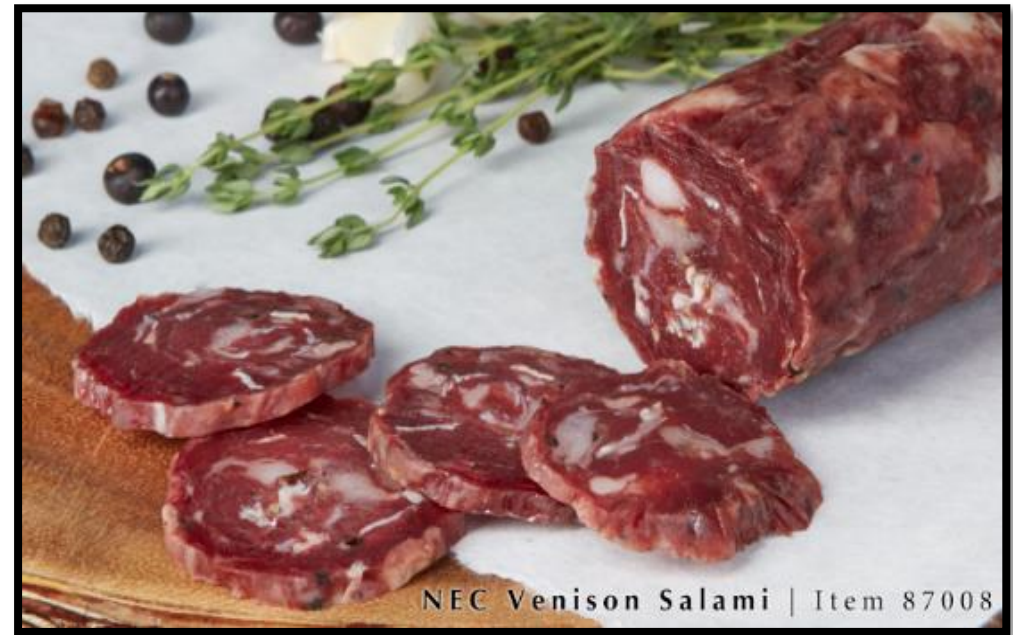
NEC Venison Salami | Item 87008