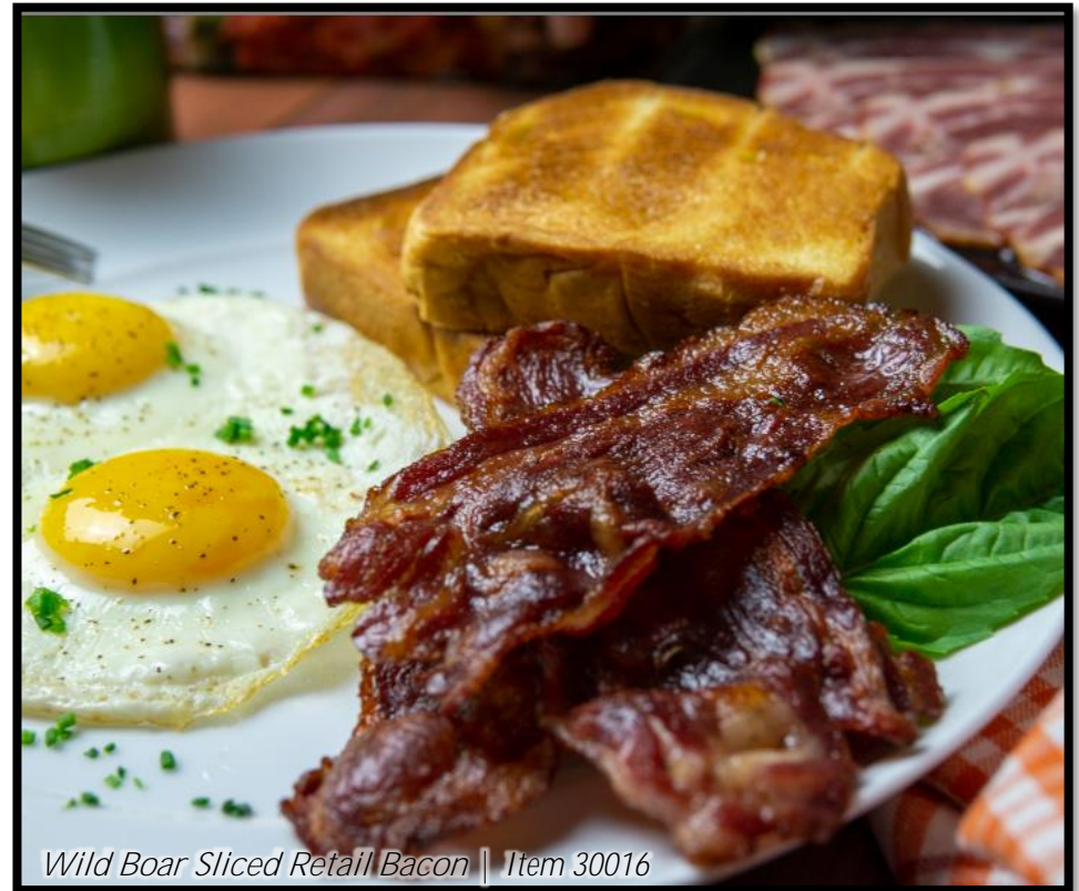
Wild Boar Sliced Retail Bacon | Item 30016

***UNLESS NOTED OTHERWISE, ALL PRICES ON THIS PAGE ARE PER POUND***