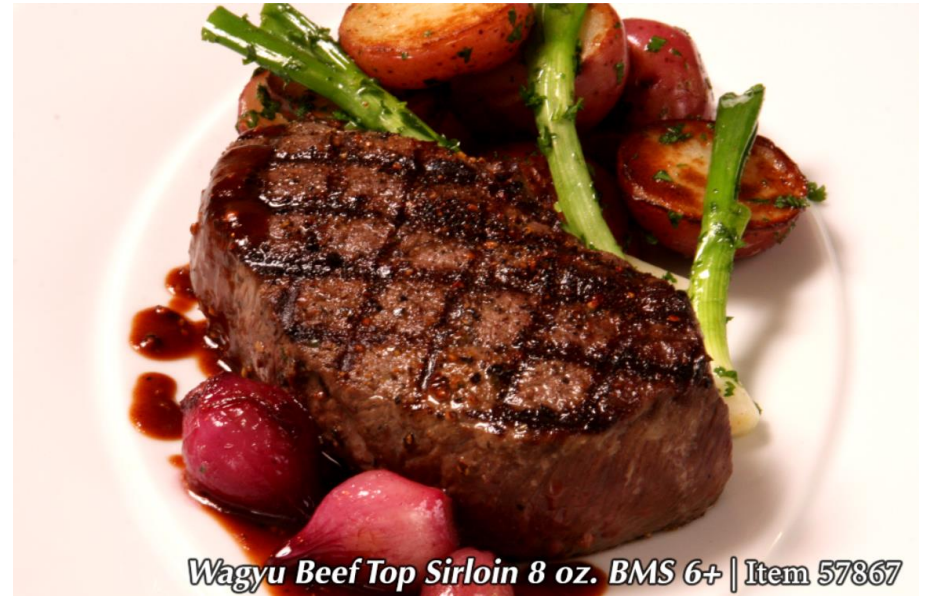
Wagyu Beef Top Sirloin 8 oz. BMS 6+ | Item 57867

Wagyu Beef BMS 6+ Top Sirloin Steaks bring a high marble score to the table at an affordable price. Experience the flavor and tenderness of this 300+ day grain fed & finished