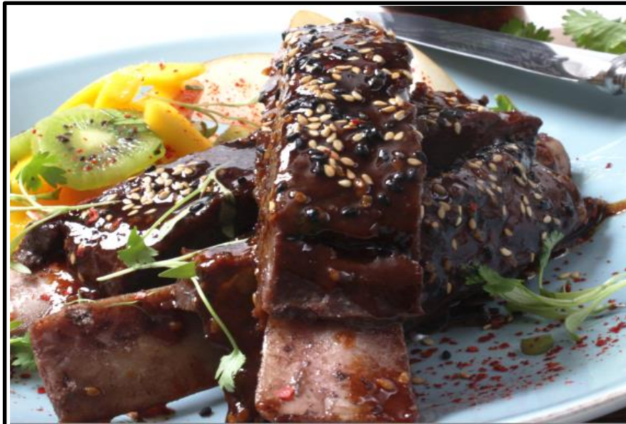
Cooked Venison Short Ribs | Item 84600