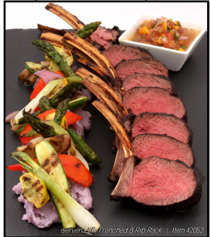
Cervena Elk Frenched 8 Rib Rack | Item 42052

New Zealand farm raised and grass fed Elk give a hint of rustic elegance to any menu. Rich yet subtle in flavor, these fabulous menu items range from frenched rib racks for center of plate presentation to portion controlled chops and medallions and ground items for out-of-the box burger plates.