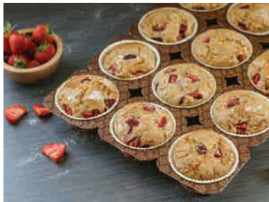
Scroll Print Baking Cups