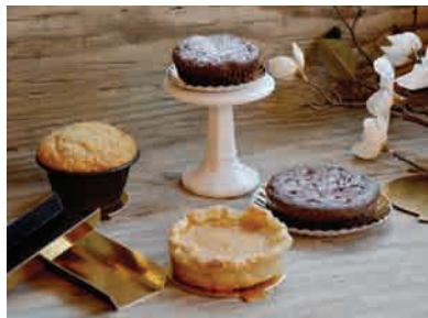
Apollo Doily Cake Boards