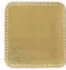
APOLLO MINI SQUARE