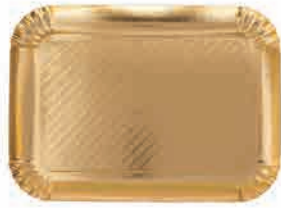
STRAIGHT EDGE TRAY