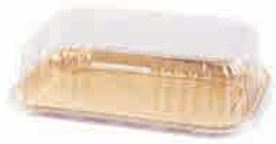
#4 & #6 GOLD TRAY LID