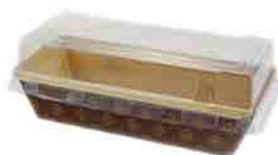
PM 178 LID