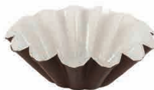
PBA 03 (BROWN)