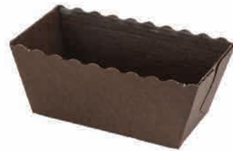
EASYBAKE MINI LOAF