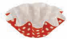
PBA 02 (RED/WHITE DOTS)