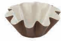
PBA 02 (BROWN)