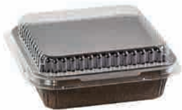
OP 100 x 100 CLEAR LID