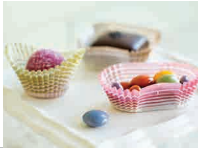
Luna Cake Boards