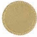
APOLLO MONO ROUND