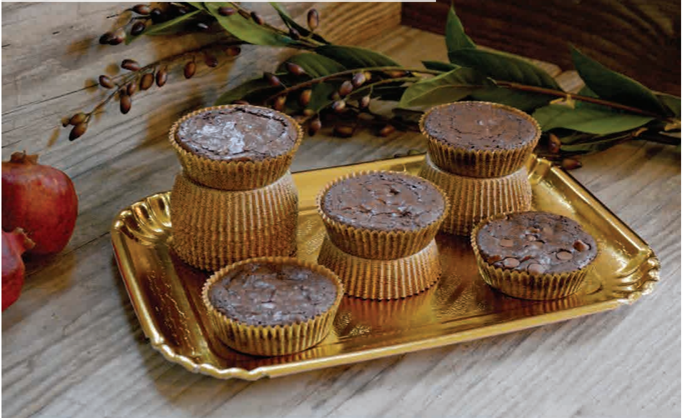
Gold pastry tray shown in rolled edge.

SOLID CARDBOARD LAMINATED WITH A GOLD FINISH PET-LAMINATED FREEZER SAFE GREASE & BEND RESISTANT OPTIONAL LID AVAILABLE FOR SIZES 4 & 6 TRAY