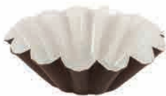
PBA 02.5 (BROWN)