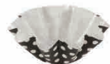
PBA 02 (BLACK/WHITE DOTS)