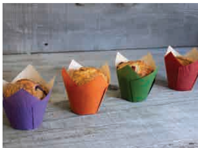
Petal Baking Cups