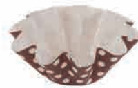
PBA 02 (BROWN/WHITE DOTS)