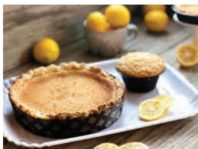
Gold Crown Cups