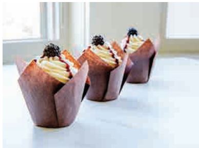
Panettone Baking Cups