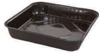
OP 175 x 175 x 30