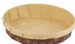
GBM 170/35 GARDENIA