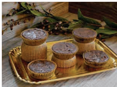
Gold Swirl Plates