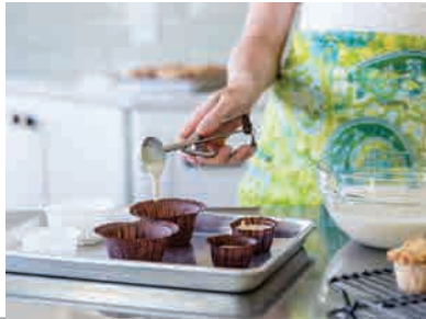
Standard White Baking Cups