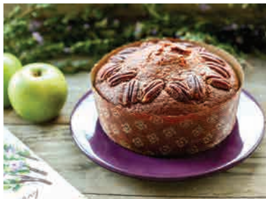
Ecos Series Round