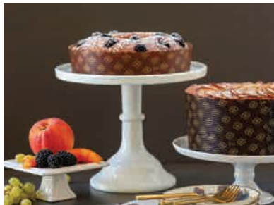
Ecos Series Terra Cotta