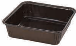
OP 80 x 80 x 35